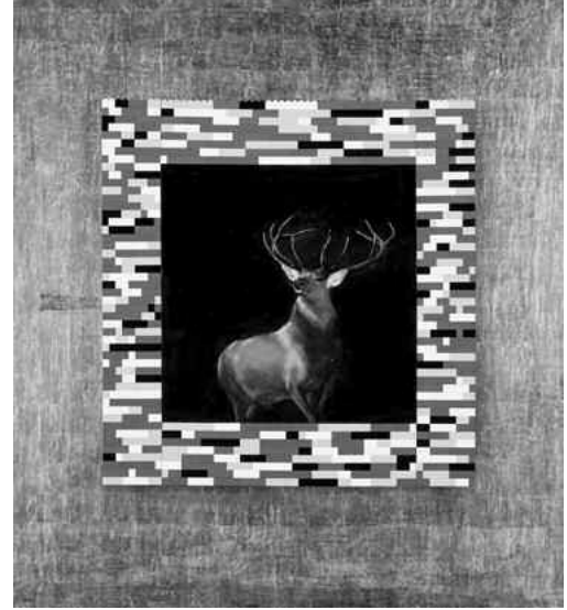
Irwin, Portrait of the Deer, mixed media (1986) Series of icons in which the symbol of the stag is juxtaposed with modernist motifs.