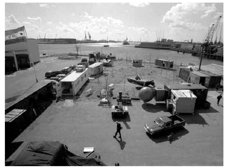
Atelier Van Lieshout, AvL-Ville, installation, Rotterdam (2001) On an abandoned plot in the port of Rotterdam a free-state was decreed to experiment with artistic freedom, anarchy and autarky.