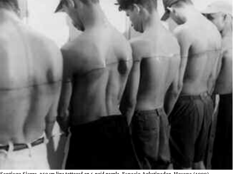
Santiago Sierra, 250 cm line tattooed on 6 paid people, Espacio Aglutinador, Havana (1999) Unemployed Cuban Youngsters having a line tattooed on their backs in return for $ 30.